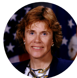
Dr. Sheila Widnall