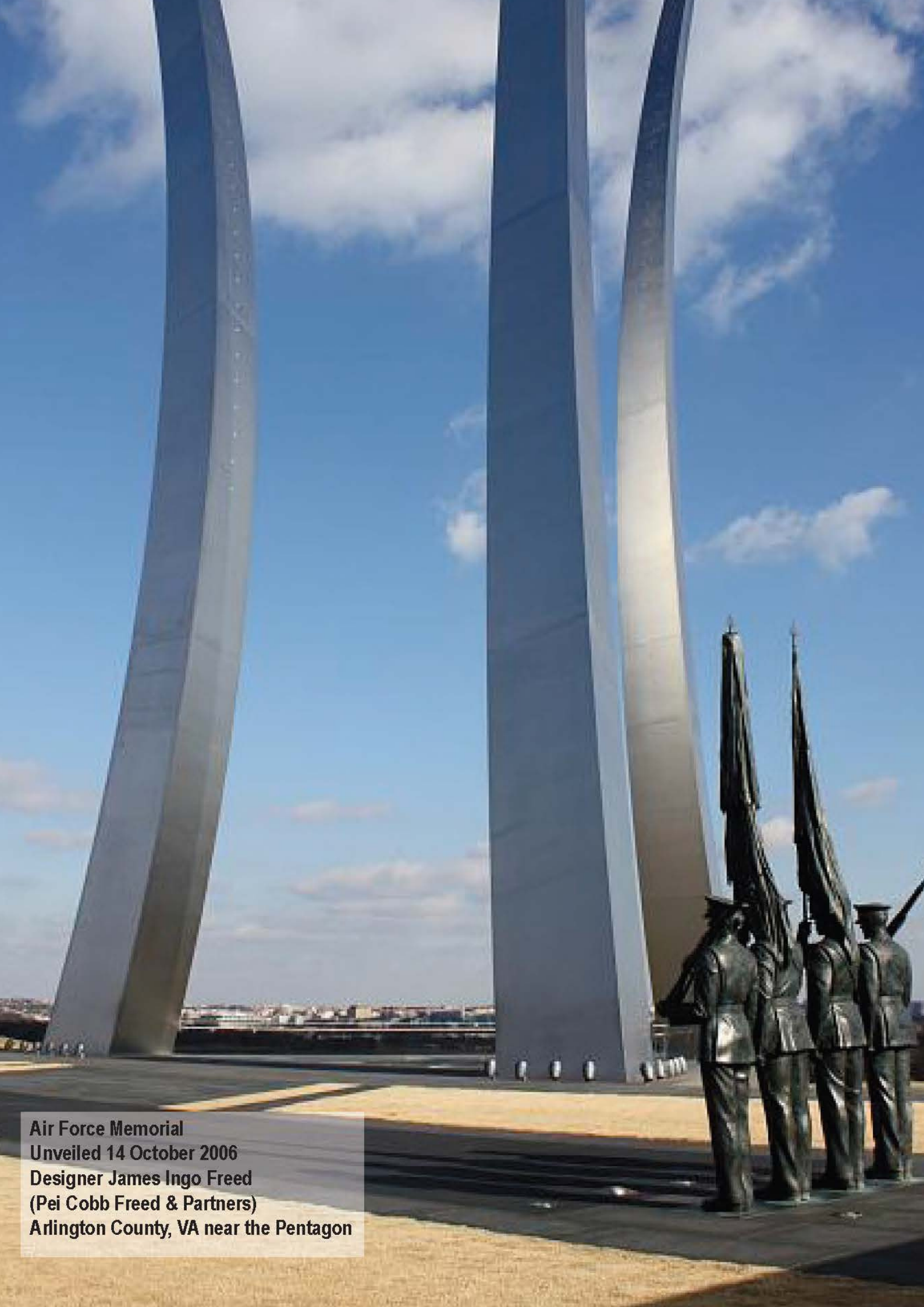
Air Force Memorial Unveiled 14 October 2006 Designer James Ingo Freed (Pei Cobb Freed & Partners) Arlington County, VA near the Pentagon