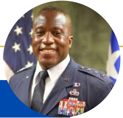
Lt Gen Stacey T. Hawkins Commander Air Force Sustainment Center

Lt. Gen. Stacey T. Hawkins is the Commander, Air Force Sustainment Center, Air Force Materiel Command, Tinker Air Force Base, Oklahoma. AFSC is a global organization composed of more than 40,000 Total Force Airmen. The center delivers end-to-end life-cycle sustainment and logistics for aircraft, missiles, propulsion systems, aerospace commodities, and weapons system software to preserve Department of Defense warfighting readiness. AFSC also manages and executes the Air Force supply chain, delivers modern software solutions through Agile and Development, Security, and Operations methodologies, provides comprehensive installation management and projects expeditionary capabilities to the Joint Force, the nuclear enterprise, interagency operations, U.S. allies and coalition partners. The Art of the Possible mission culture underpins how AFSC optimizes its world-class people, facilities worth $27.2 billion across three installations, and a $26.8 billion spare parts inventory to generate $16.6 billion in annual revenue from maintenance and supply chain operations.