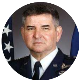
Gen Ronald R. Fogleman

Assistant Senior Executive Advisor of AFCOMAP