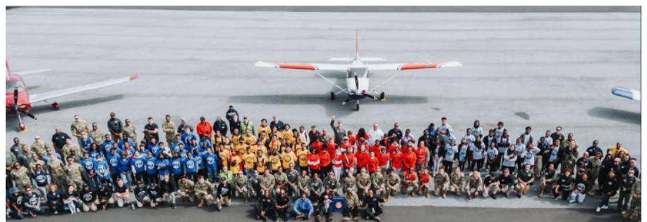
Legacy Flight Academy (LFA) September 24, 2022, Maryland Airport, Indian Head, MD "Eyes Above the Horizon"

On September 24th, 2022 and April 15, 2023, AFCOMA members participated in "Eyes Above the Horizon," an outreach event at Maryland Airport in partnership with the Legacy Flight Academy and Southern Maryland. The event was designed to inspire, educate, and motivate high school students to pursue careers in aerospace and STEM. The event featured orientation flights, an interactive curriculum, and instruction on character development, including the legacy of the iconic Tuskegee Airmen. AFCOMA's participation in this event highlights the organization's commitment to promoting STEM education and encouraging the next generation of aerospace professionals... (Right photo)